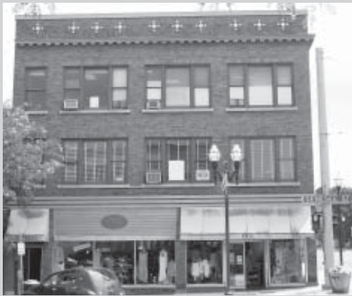
Auburn Branch Office 132 Genesee St. Auburn, NY 13021 (315) 253-8411